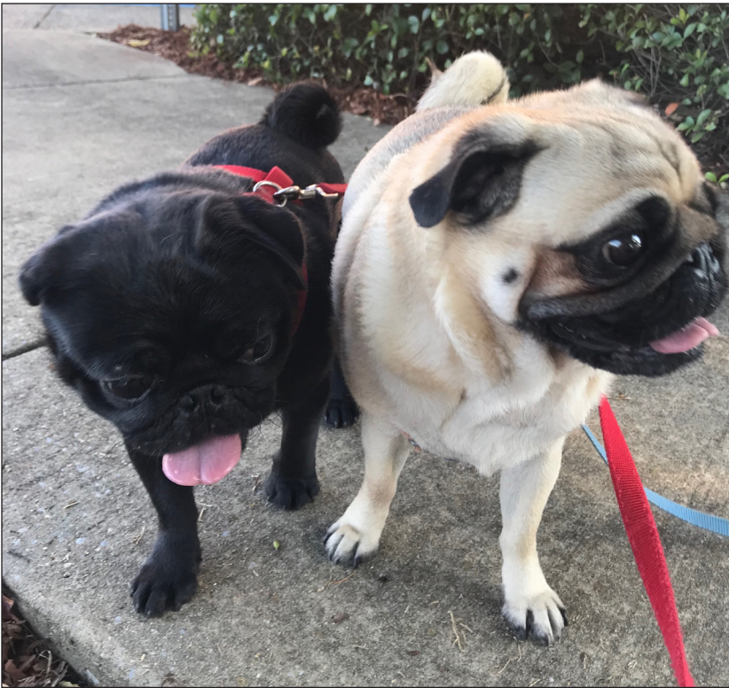
Philosophy Department pugs Otter (left) and Scout (right).